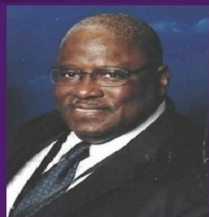
Initiation Date: March 16, 1973 - Beta Chapter Omega Chapter: October 31, 2013